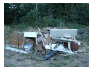
Pile of Junk from the Basement