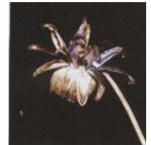
A dahlia seedpod ready to be harvested.