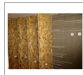
Storage Area in Progress

We'll be showing it off at our September meeting - don't miss the preview!