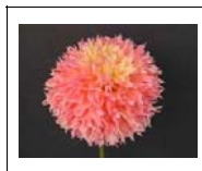
New Origination Tahoma Powder Puff